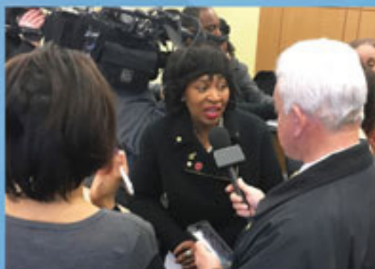
Congresswoman Jones being interviewed by the press discussing her legislative priorities which included Affordable Housing and Medicare for All.