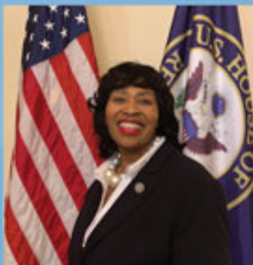
Congresswoman Brenda Jones voted 77 times which included introducing and Co-Sponsoring The SHELTER Act and The Minimum Wage Fairness Act even though her term was a little over a month.